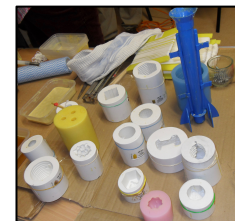
So many moulds!

Then with practical demonstrations, Jen Ferry and Sheila Stunell guided us through the fascinating alchemy of candle making-both moulded and dipped. Several members took the opportunity to make their own candle and also to create 'Luminaires' (wax bowls to hold tea lights). This involved dipping water filled balloons in molten wax; what could possibly go wrong! Thankfully nothing.